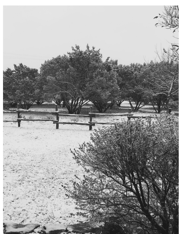
Snow photo from Jeanne